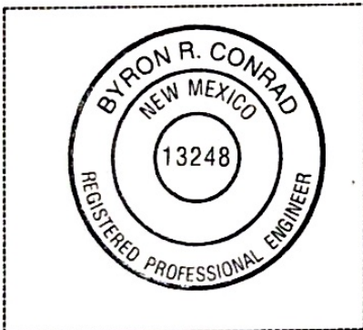
Professional Engineer Stamp