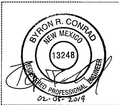
Professional Engineer Stamp