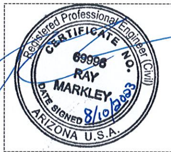
Professional Engineer Stamp