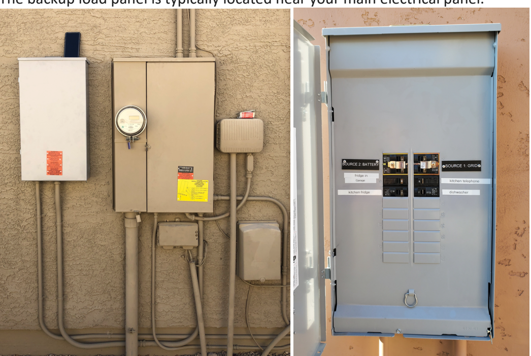
Figure 1 – Location of Backup Load Panel

The backup load panel is typically located near your main electrical panel.