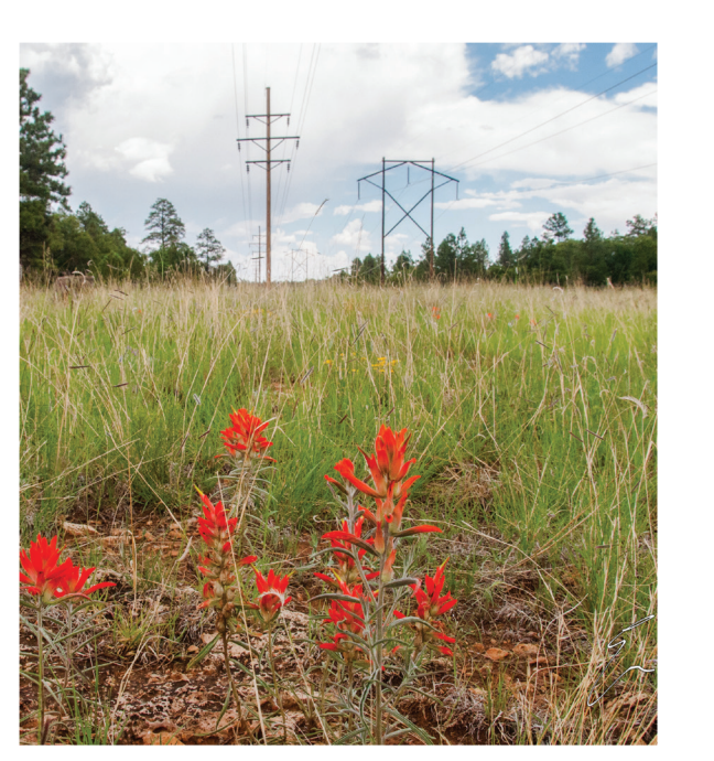
Healthy Right of Way

structures, fences, shrubs, trees, sprinklers or irrigation systems closer than 10 ft. in front of the door and 2 ft. from the sides, and 6 ft. by 6 ft. on the left side corner of the pad.