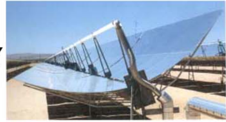
Solar Trough Industrial Solar Technologies Corporation

Trough systems are an alternative to solar photovoltaic systems. This is especially true where there is a need for hot water and electricity. Trough systems absorb the heat from the sun. Because of their parabolic shape, troughs can focus the sun at 30 to 60 times its normal intensity on a receiver pipe located along the focal line of the trough. Synthetic oil captures this heat as the oil circulates through the pipe, reaching temperatures as high as 750°F. The hot oil is pumped through a heat exchanger on the power production side of the plant to produce steam. Electricity is produced in a conventional steam turbine or an organic Rankine cycle machine. The power cycle is completed with the condensing of the steam through a cooling tower and then pumping it back through the heat exchanger connected to the solar energy collection field. The solar trough is more complex than the comparably sized solar PV systems due to the addition of cooling towers, heat exchangers, valves, pumps, turbine, and generator.