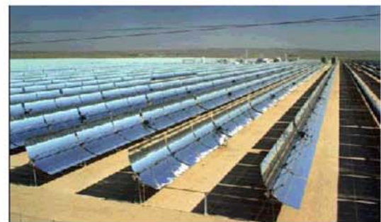
Solar Field Solargenix Energy