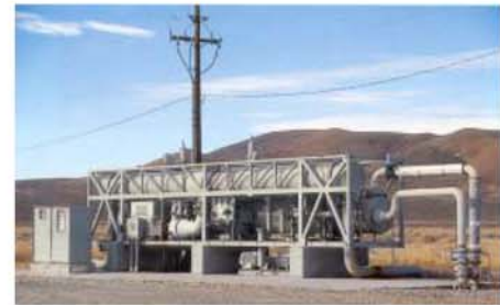
Power Block Ormat Corporation