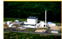
Direct Fired Plant DOE EERE Energy Website

Cofiring involves replacing a portion of the coal with biomass at an existing power plant boiler. For utilities and power generating companies with coal-fired power plants, cofiring with biomass may represent one of the least-cost renewable energy options. It is easiest to implement with old stoker type boilers rather than pulverized coal systems. Small Modular Biopower Working with industry, the U.S. Department of Energy's Small Modular Systems Project is developing small, efficient, and clean biomass systems of less than 5MW scale.