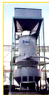
Small Modular Biopower DOE EERE Energy Website