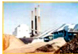
Cofiring Plant DOE EERE Energy Website