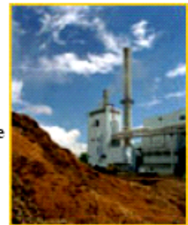
Gasification Plant DOE EERE Energy Website